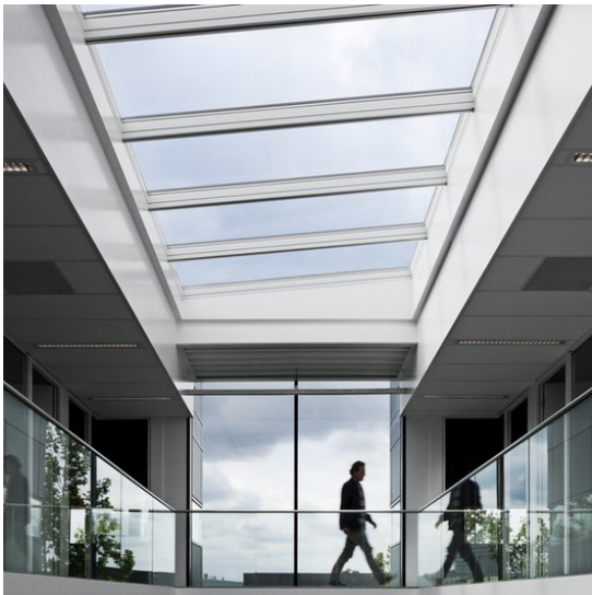
Modular Skylights - Longlight 5-25°