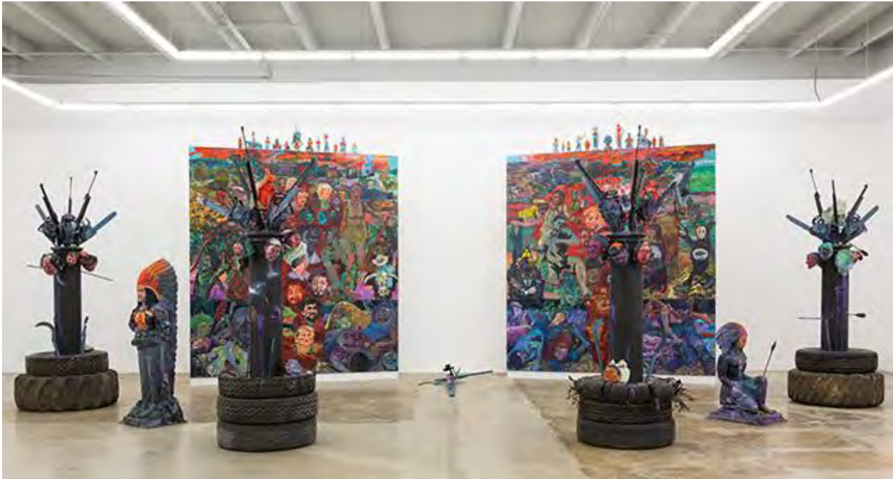
New Shamans/Novos Xamãs Installation View, 2016.

( http://thecreatorsproject.vice.com/tag/ArtWeekMiami2016 ).