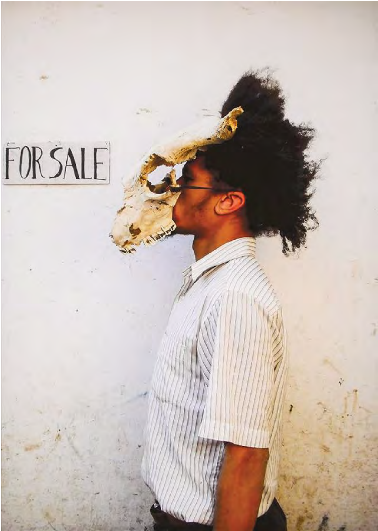
Paulo Nazareth, Untitled from the For Sale Series