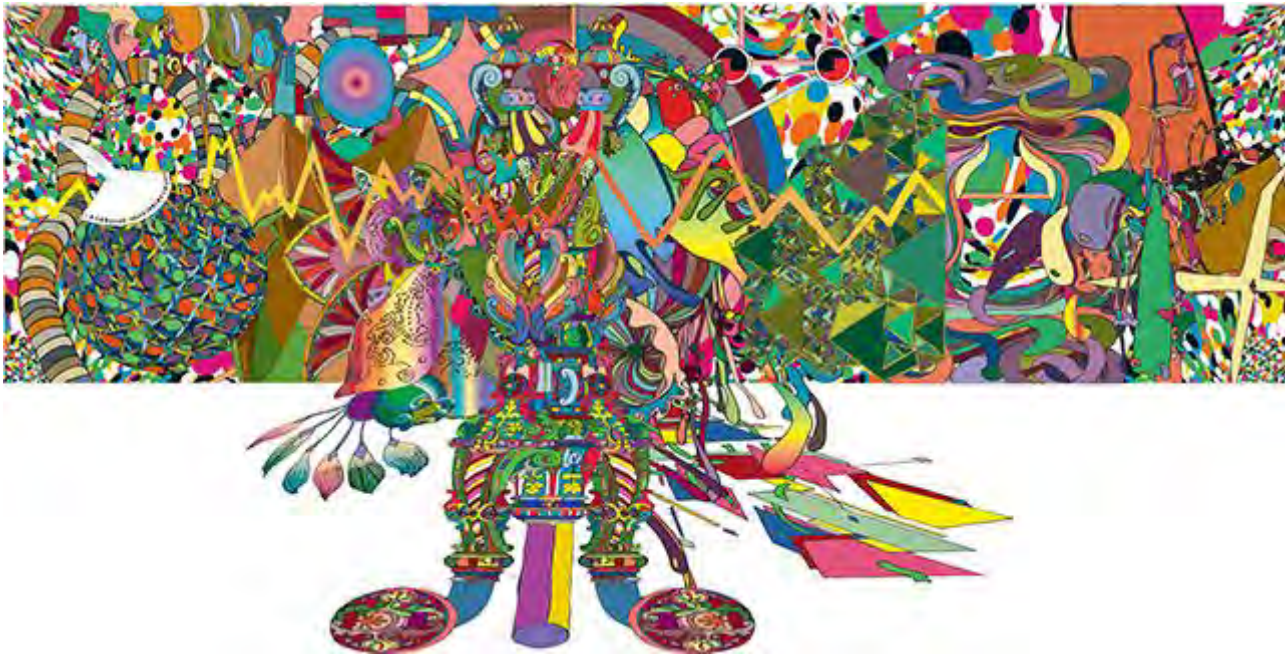
assume vivid astro focus, Untitled (Garden #6)