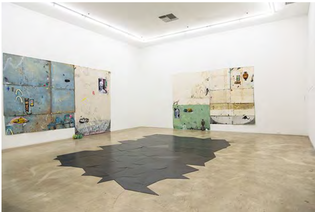
New Shamans/Novos Xamãs Installation View, 2016