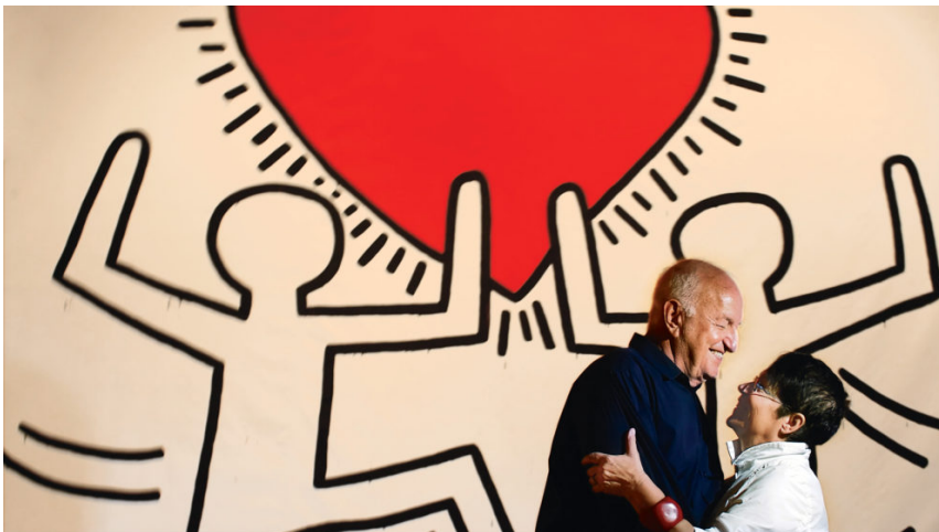
The Rubells in front of a Keith Haring.