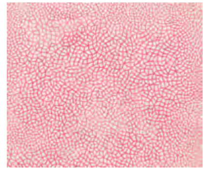
Yayoi Kusama, INFINITY NETS (H10) (2010)

30, 2016, through Jan. 8, 2017. Born in 16 countries across five continents, 37 contemporary artists use their aesthetically diverse work to address varied political and intellectual themes. The presentation is organized by the Rubell Family Collection (RFC)/Contemporary Arts Foundation, Miami, in collaboration with NMWA. The exhibition in Washington, D.C., centers on the process of making as well as images of the female body—both topics that extend from the feminist art movement of the 1970s.