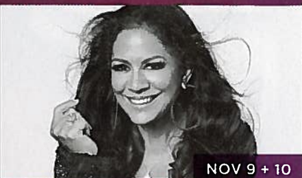
DEE DEE BRIDGEWATER