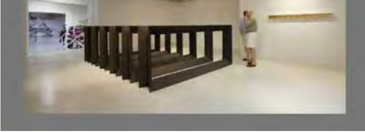
Installation view of the Margulies Collection at the Warehouse.