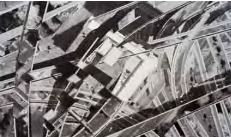
Miguel Amat, "Capitalismo y Vanguardia," series (2006–2010) on view at the Fontanals-Cisneros Collection.

Public access: 591 NW 27th Street, Wynwood, Miami; admission: $10 (a donation) for Lotus House Homeless Students, $5 for out-of-state students, and no charge for students in the state of Florida; margulieswarehouse.com