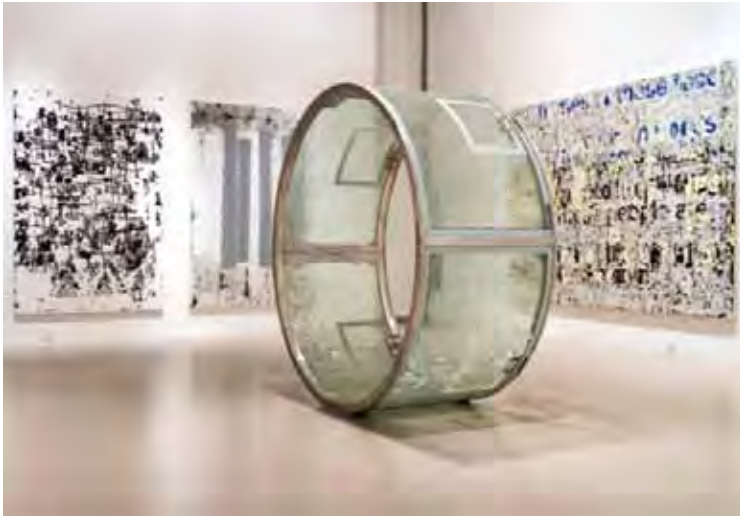
Installation view of the de la Cruz Collection with works by Christopher Wool , Mark Bradford, and Dan Colen.

Free public access: 95 NW 29th Street Miami rfc.museum